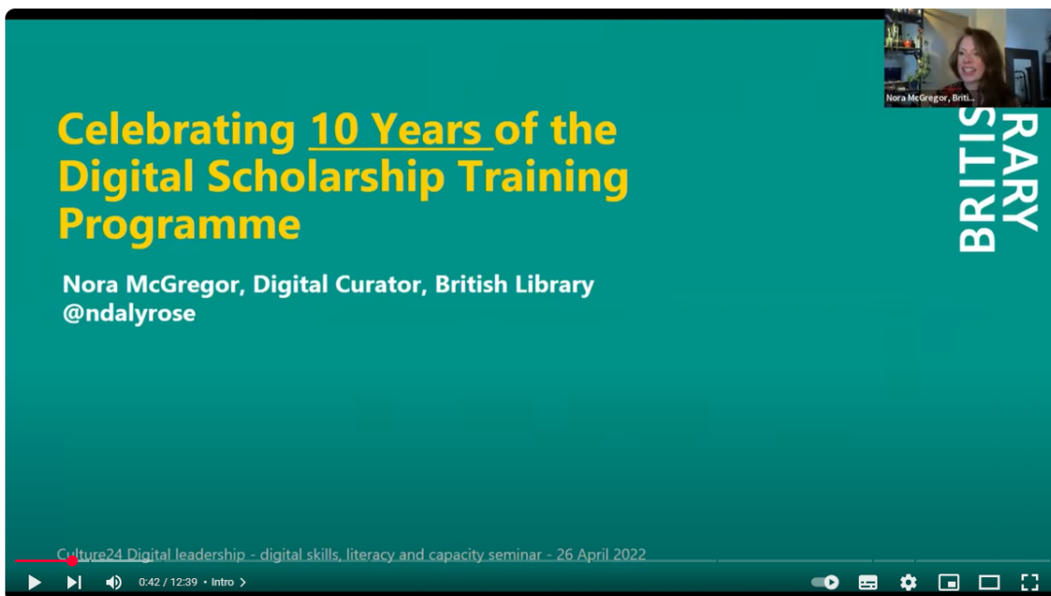
Figure 2: A video lecture celebrating 10 years of the Digital Scholarship Training Programme at British Library.