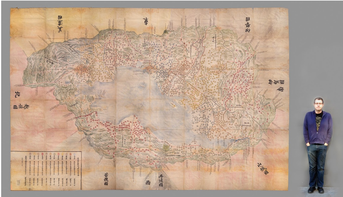
Figure 2: An image of a man standing next to the Ōmi Kuni-ezu Japanese Tax map to give a sense of the scale of the object.

Have a play and view this image in their Mirador viewer here